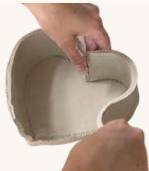
Pottery (Hand Build)